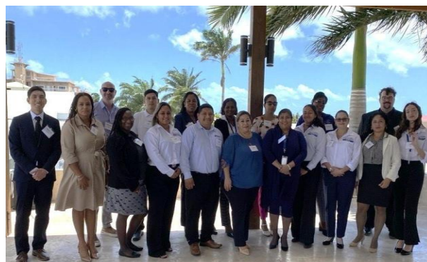
(Sanction workshop hosted by the United States)

In addition to these milestones, our heightened presence at International Maritime Organization (IMO) meetings and workshops underscores our dedication to staying at the forefront of industry developments and regulatory compliance. Moreover, we have recently launched a series of initiatives focused on fortifying our fleet capabilities and minimizing detentions, further solidifying our commitment to operational excellence and sustainable growth within the maritime sector. These concerted efforts exemplify our proactive approach towards enhancing standards and fostering innovation in the industry.