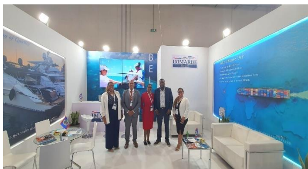
(IMMARBE Delegation at Posidonia – June 2024)

The recent advancements encompassed achieving maximum participation at the prestigious Posidonia exhibition, serving as a clear indicator of the transformative strides underway within the registry. Furthermore, plans are underway for a robust presence at the upcoming Sea Asia exhibition, presenting an invaluable opportunity to engage with key stakeholders in the Asian market. Additionally, strategic efforts are being directed towards expanding our network of designated offices in key locations to catalyse business development initiatives. These strategic moves highlight our unwavering commitment to fostering growth and excellence within the Registry.